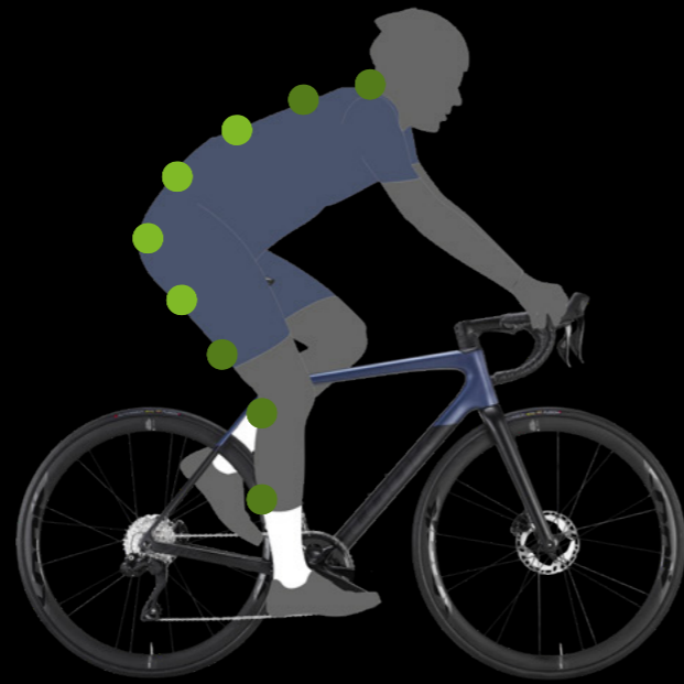
Position designed for long ascents