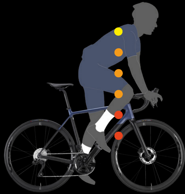
Optimal power transfer during accelerations